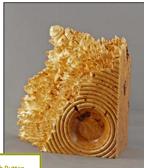
Keith Ruttan – Candle Holder – 7X3.5 – Maple Burl – WoP