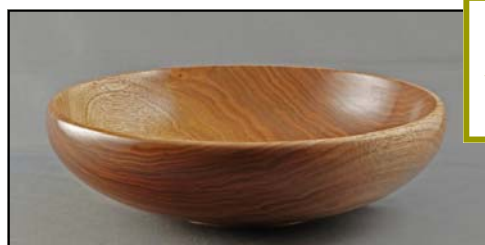
Dex Hallwood – Bowl – 9X3 – Walnut – Shellawax