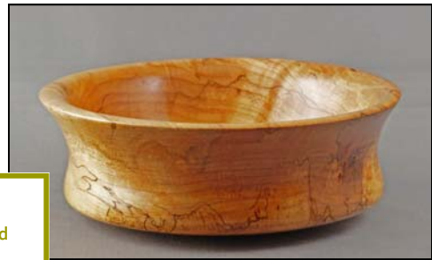
Rachel Tuis – Bowl – Spalted Something