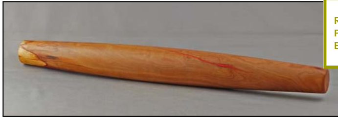
Rachel Tuis – Rolling Pin – Photinia, 2 Part Epoxy – Beeswax