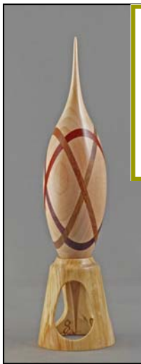
Keith Hudson – 3.25X12 – Maple, Spalted Birch