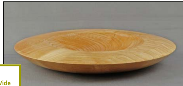
Dex Hallwood – Wide Rim Bowl – 9X1 – Maple – Tung Oil