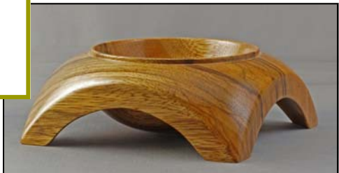
Dennis Houle – Square Bowl – 7X3 – Black Limba – WoP