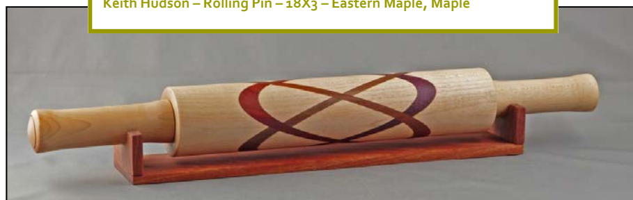
Keith Hudson – Rolling Pin – 18X3 – Eastern Maple, Maple