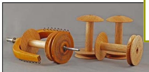
Bob Askew – New Bobbins for Old Spinning Wheel – 3X4.5 – Oak – Tung Oil 2