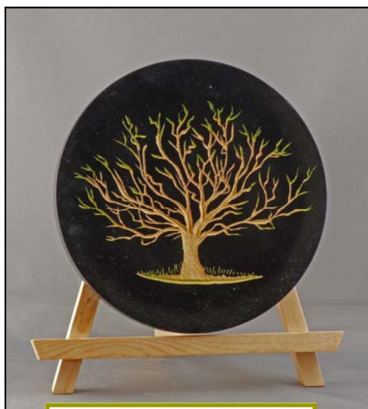
Dan Lemire – The Buds of Spring – 8” – Crate wood from Phillipines – Black Paint, Lacquer – Knife Carving