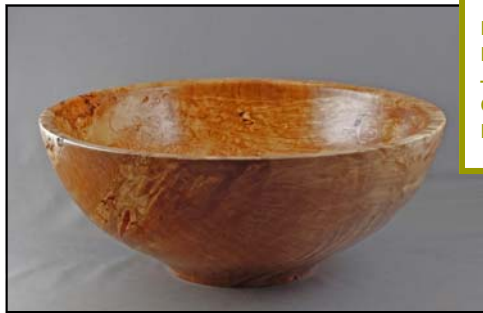
Ross Pilgrim – Burl Bowl – 15X7 – Maple – Tung Oil – Unfinished Bottom