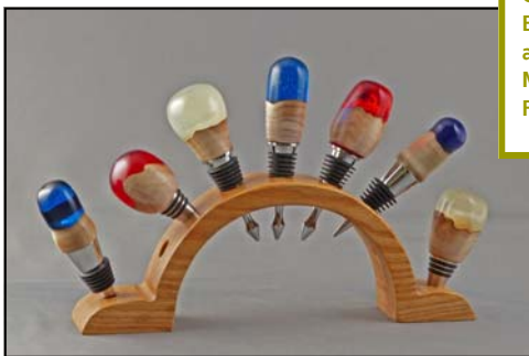
Gary Burns – 7 Bottle Stoppers and Stand – Maple & Acrylic – Friction Polish