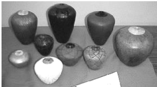
Art Liestman's hollow forms