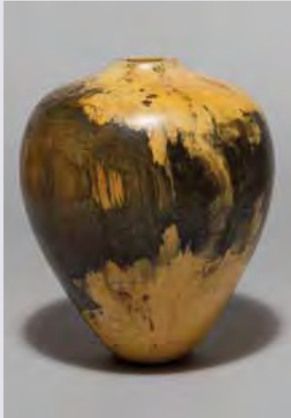
Here is the simplest setup: overhead light comes from a single compact fluorescent photo bulb mounted in a socket with a reflector but no diffuser. The lighting is flat with no sense of depth, and the shadow is strong.

run for a long time at low temperatures, and have a lifespan of a few thousand hours. At $8 to $10 each, they are more expensive than the lamps available in home centers, but their quality is worth it. In the setups shown in this story, I'm using a single 43-watt bulb in a small ball-head fixture attached to a lightweight aluminum stand. My hardware is ancient, but you can buy similar gear for $20 or less. When I need more light, I add a 27-watt bulb as a fill light.