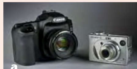
Two kinds of digital camera The digital single-lens reflex (DSLR) camera on the left has interchangeable lenses, a large sensor, and many manual settings. The compact camera on the right may be all you need because it has a manual mode that gives you control over the exposure.

Most DSLR sensors are sized like 35mm film, with a 3:2 width-to-height ratio. Compact cameras primarily use a 4:3 ratio. This makes a difference when you want a specific enlargement such as an 8" by 10" print (4:5 ratio): You'll have to crop the image to achieve it.