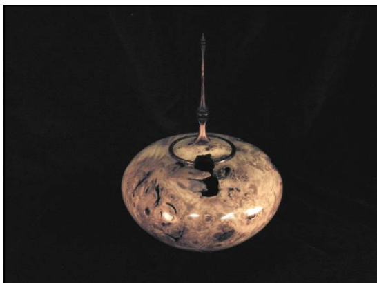
Container - Larry Stevenson - Lombardy Poplar - 6in x 5in - Lacquer