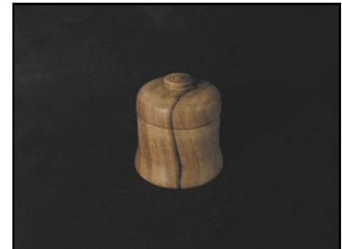
Instant Gallery: Box - Merv Graham - Black Walnut - 2in x 2in - Wax

In 2007 we have the hall booked for a session on the second Saturday of each month, and we want them to be as useful and relevant as possible. If there is a subject that you would like us to cover please let me know.