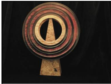
Instant Gallery: Art - Sandy Howkins - Maple - 14in x 18in - Tung Oil