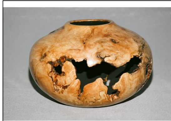
1st Place Intermediate Class - Rich Schmid Birch Burl Hollow Form, $750 prize