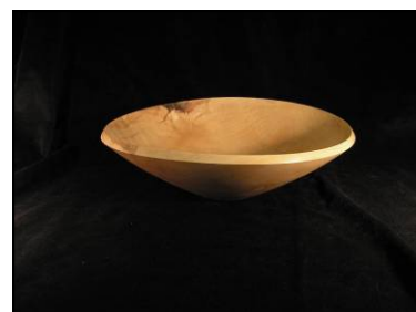
Instant Gallery: Salad Bowl - Jared Altman - Birch - 12in x 4in - French Polish