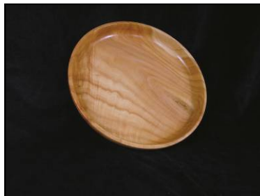
Instant Gallery: Bowl - Ed Auld - Red Cedar - 8in x 1in - Tung Oil and Wax