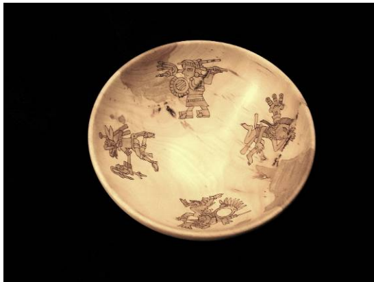
Small Bowl - D&M Gendron - Apple - 5in x 3in - paste Wax