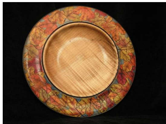
Platter - Bruce Campbell - Maple - 14in x 2in Lacquer