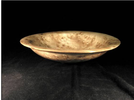
Salad Bowl - Rich Schmid - Birch Burl - 14in x 4in - Salad Bowl Finish