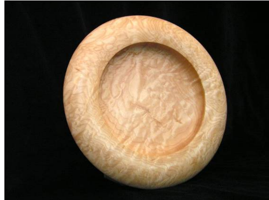
Platter - Clayton MacGregor - Maple - 12in x 1-5in - Tung Oil