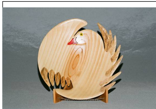
3rd Place Intermediate Class - Len Sawyer SuperNova2 Chuck