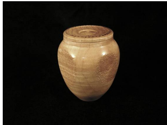
Urn - Marco Berera - Maple - 2-25in x 3-5in - Buffing