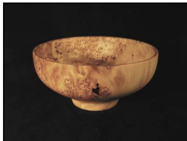
Instant Gallery: Bowl - Plumb Bob - Birds Eye Yellow Cedar - 8in x 5in - Min- eral Oil Beeswax